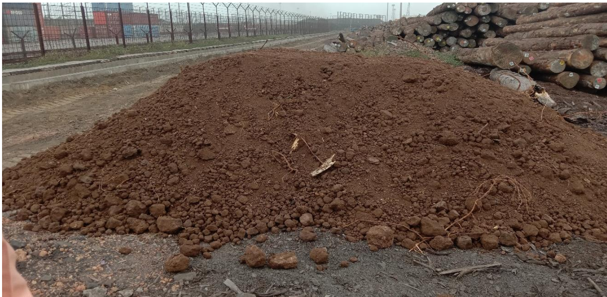
Fig. 5 Fertile Soil for Better Survival of Plants