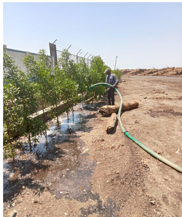
Fig. 8 Regular Watering of the plants by tanker