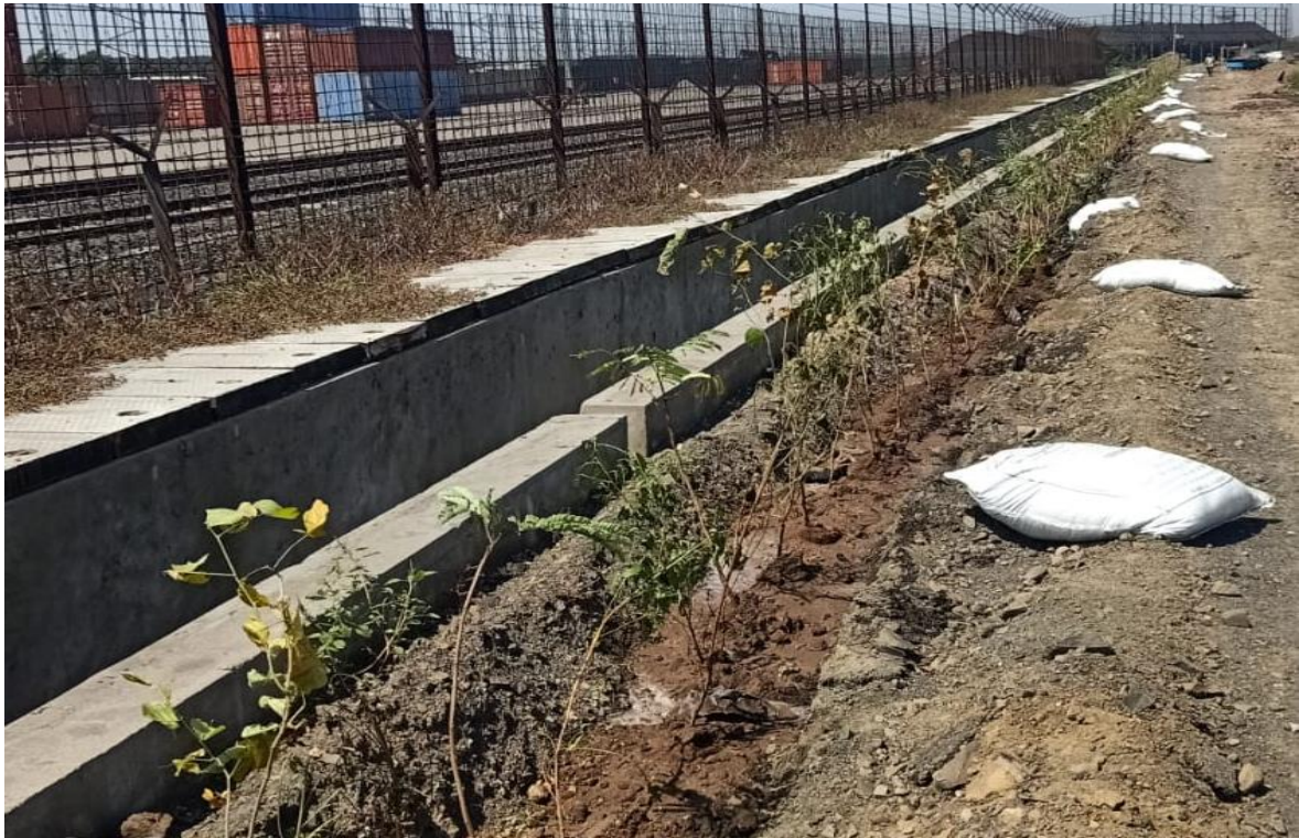
Fig. 7 Organic Manure for Better Growth and Survival