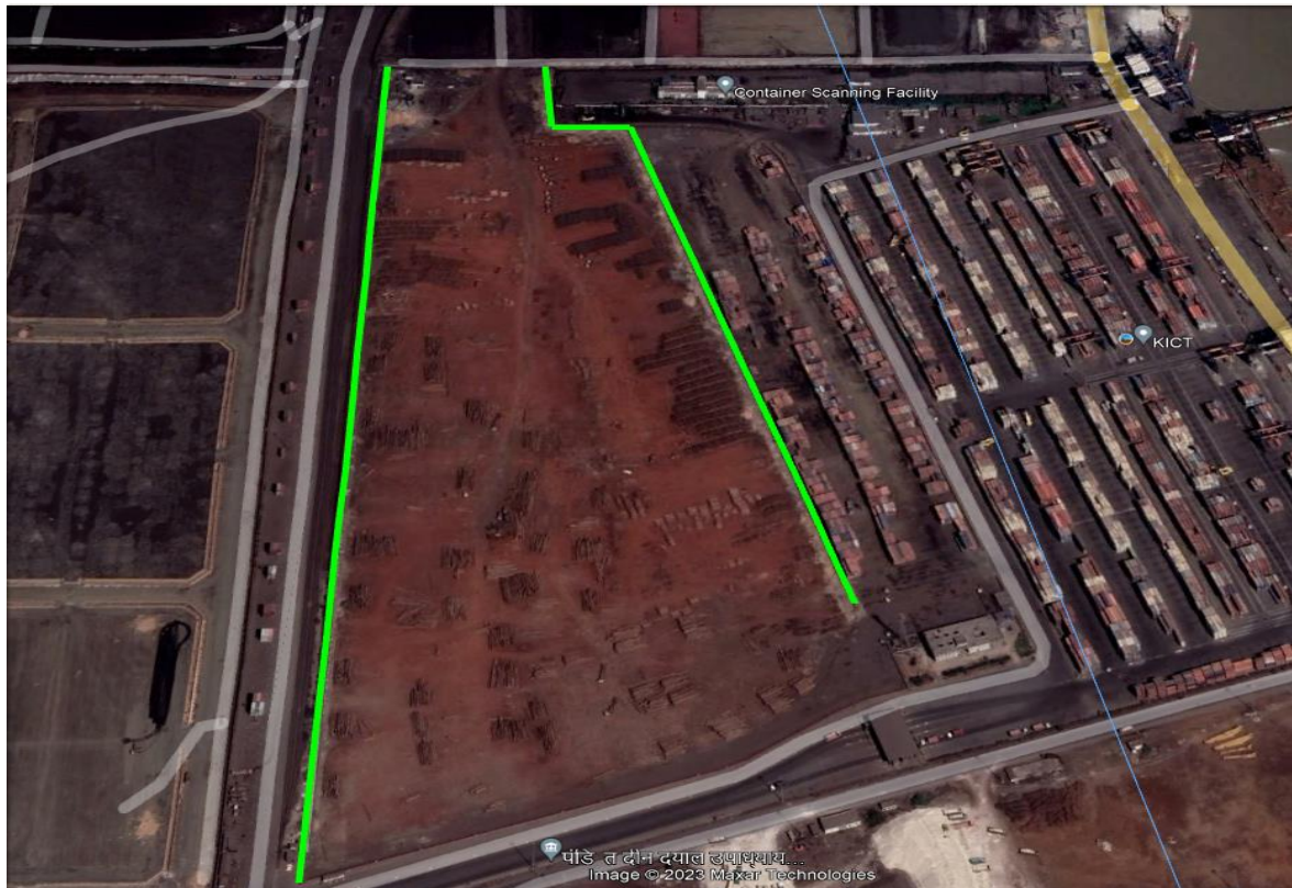
Fig. 2 Map of Plantation Area