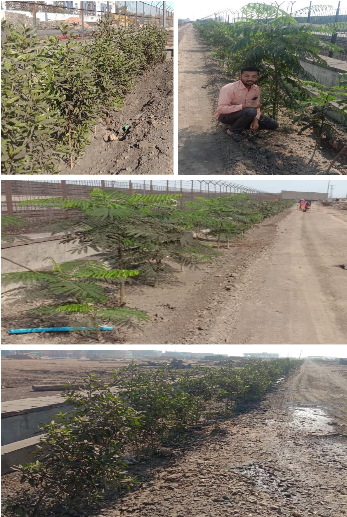
Fig. 11 Plantation in February 2023