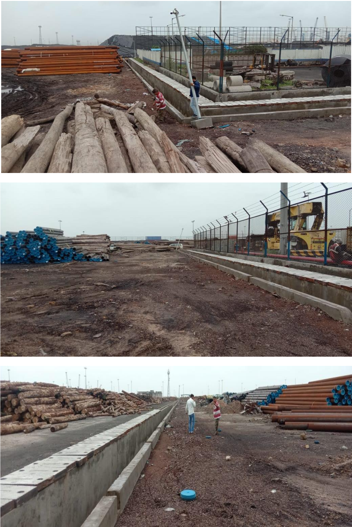
Fig. 1 Before Plantation