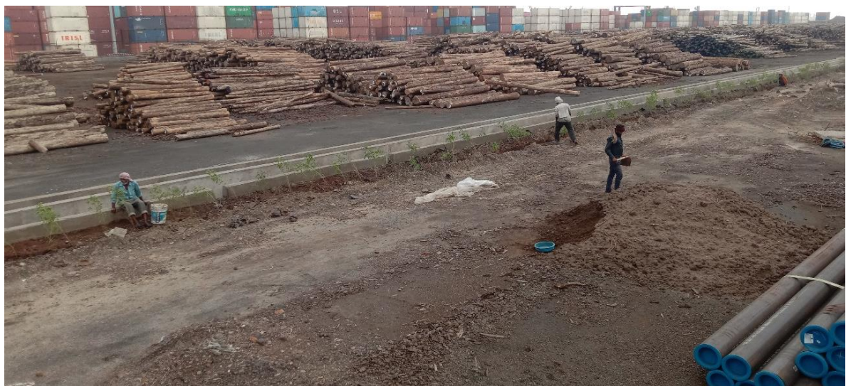
Fig. 6 Plantation Pits of Soil Filling