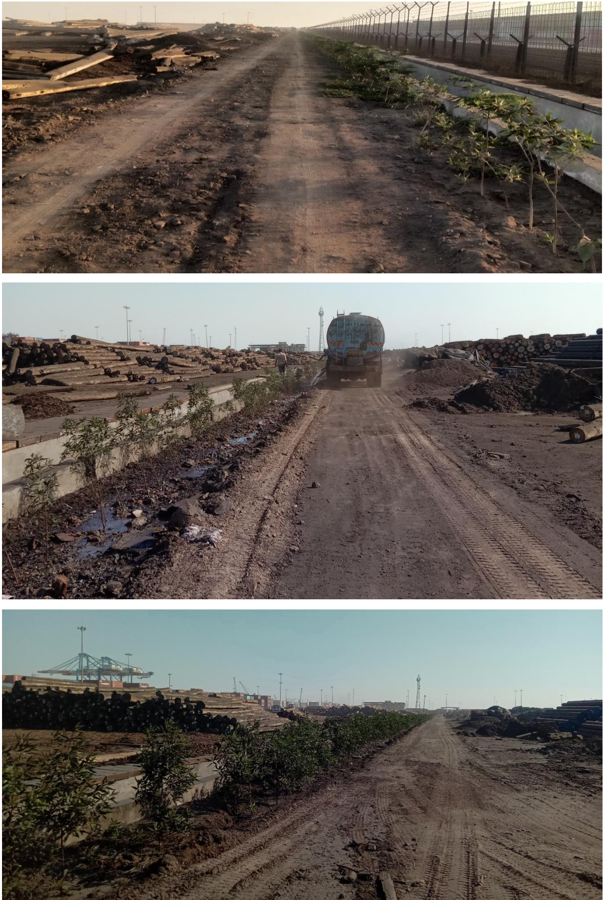
Fig. 10 Plantation in December 2022