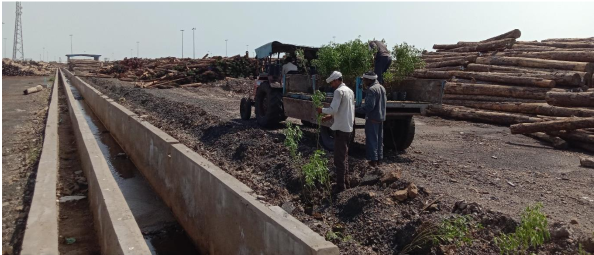
Fig. 4 Transportation of Plants to Site