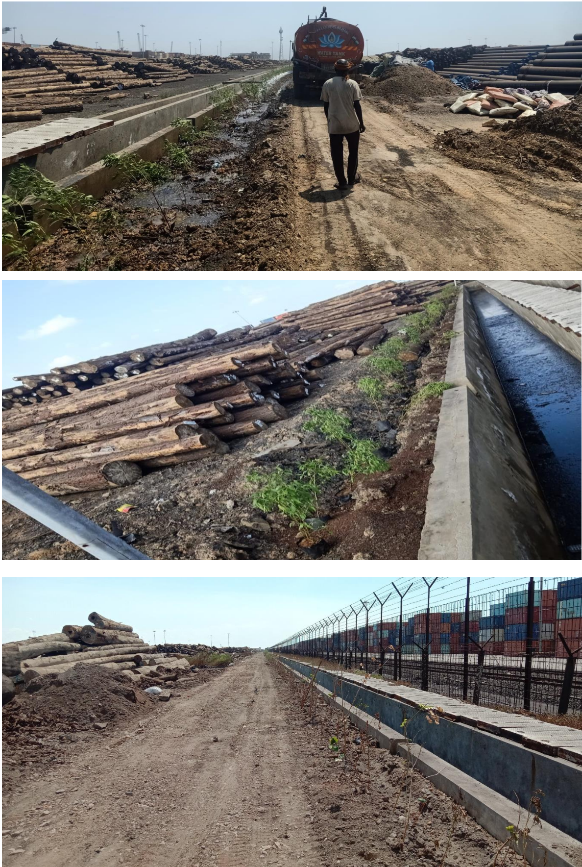
Fig. 9 Plantation in October 2022