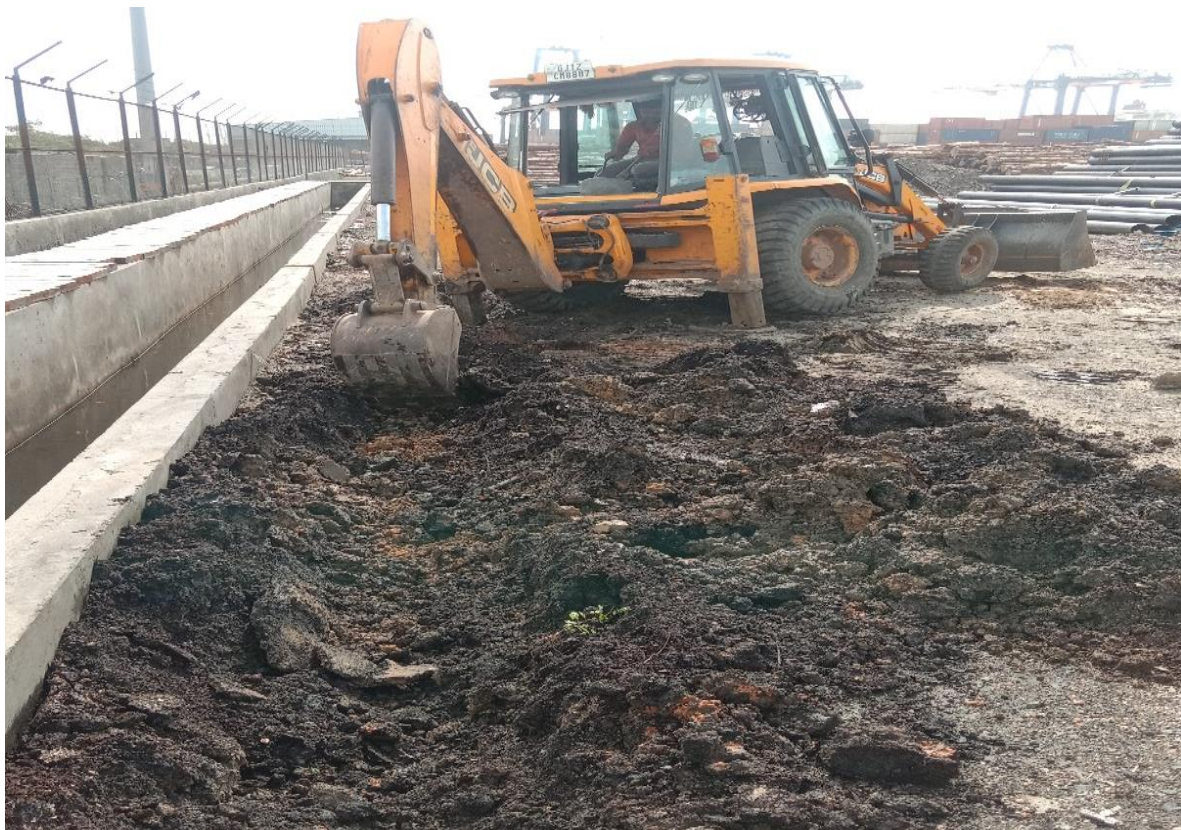
Fig. 3 Digging Out Trench for Plantation